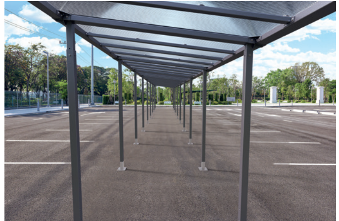
Code 599800 + 599801