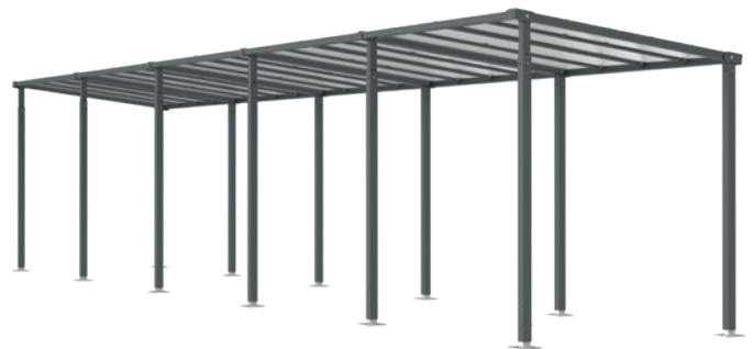
Code 599800 + 599801